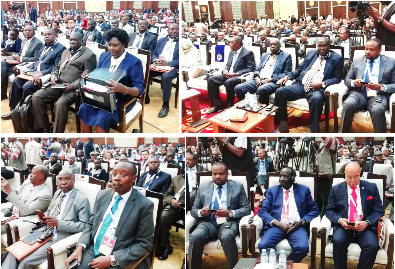
Members of the Governing Council of the AMGC attending the official opening of SIMFE 2019