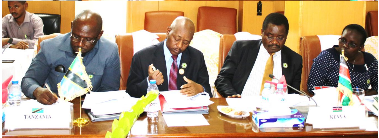
Members of the 22 th Standing Committee of Officials in session