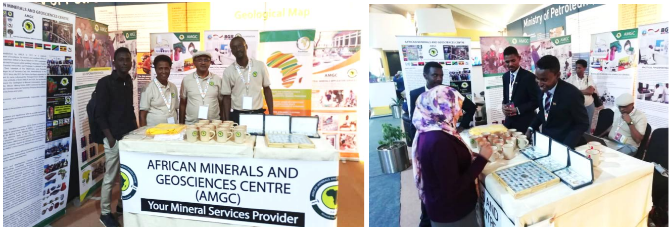
AMGC Staff displaying services and products during the SIMFE exhibition

The 39th meeting of the GC was held in parallel with the 4th annual Sudan International Mining Forum and Exhibition (SIMFE) 2019. The SIMFE is an annual gathering of the mining sector in Sudan and it was held at the Friendship Hall of Khartoum from 18 to 20 February 2019. AMGC participated in the Exhibition by displaying its services and products for the mineral sector community of Sudan.