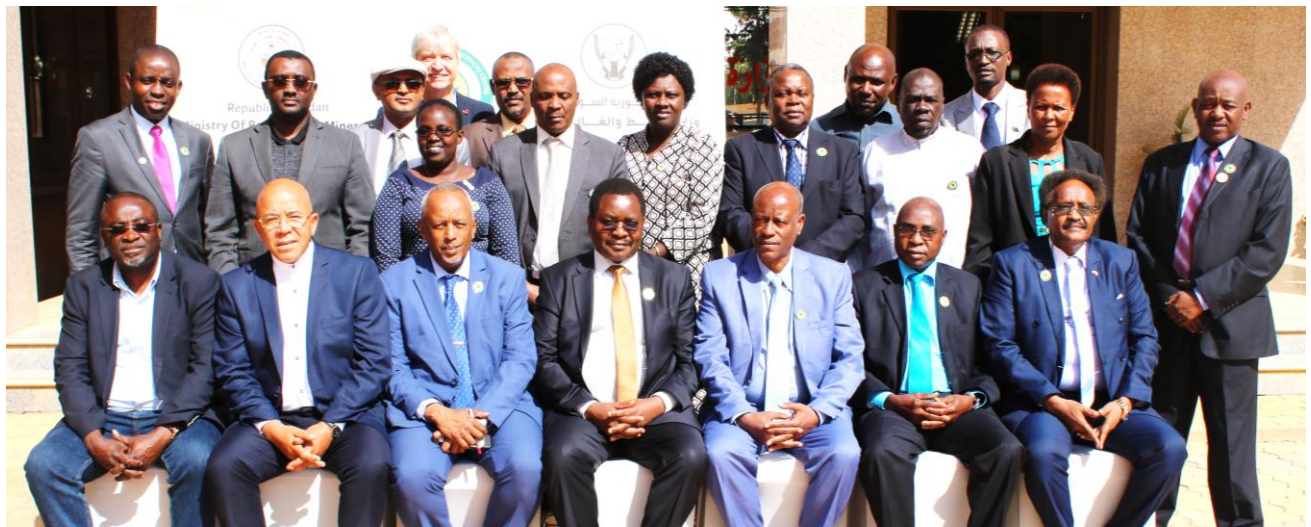
The 22 th Standing Committee of Officials in a group picture with the Secretariat of the Policy Organ Meetings.