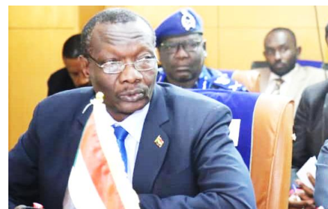
Members of the 39th meeting of the Governing Council of the AMGC in session