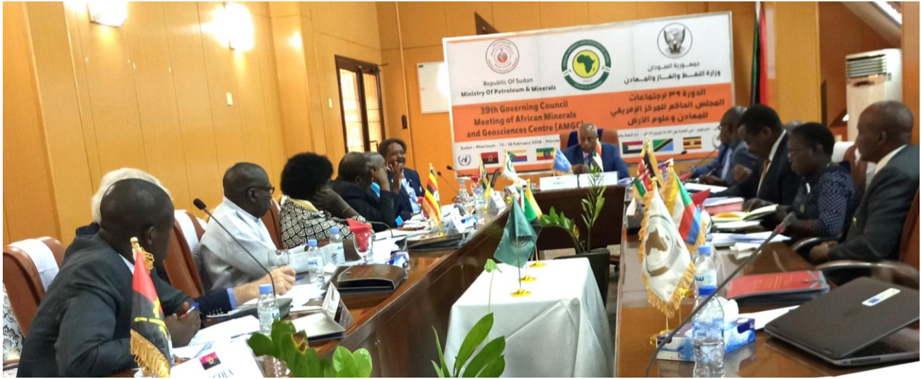
Members of AMGC Board of Directors in session