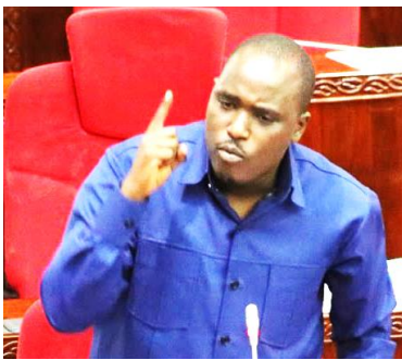
Hon. Doto Mashaka Biteko, Minister of Minerals of Tanzania