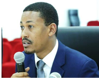
H.E. Dr. Samuel Hurkato, Minister of Mines, Petroleum and Gas of Ethiopia

AMGC congratulates the newly appointed ministers responsible for mineral resources of Tanzania and Ethiopia