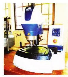
Polishing Machine for Polished Mount Preparation