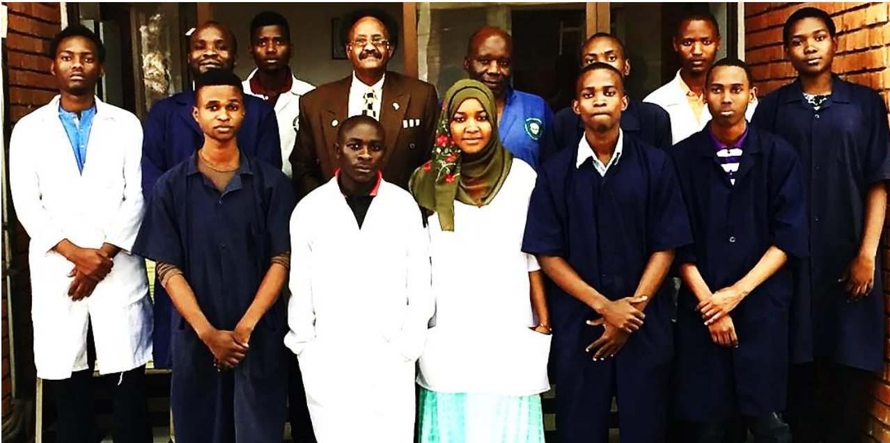
AMGC Director General and Managers of Mineral Processing & Small Scale Mining in a group picture with nine undergraduate students studying minerals processing engineering at University of Dodoma, Tanzania who are currently undergoing a practical training for one month at AMGC.