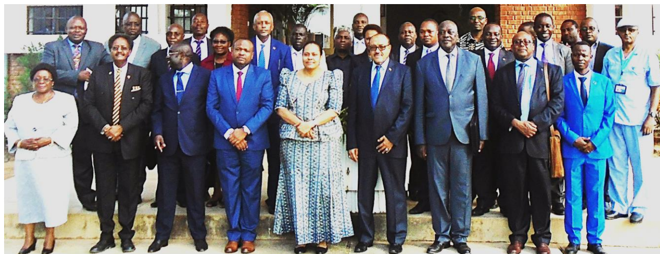
A group photo of the delegates of the 38 th AMGC Governing Council held in Dar es Salaam, Tanzania

Hon. Kassim M. Majaliwa, the Prime Minister of Tanzania shaking hands with Hon. Angellah Kairuki, the Minister of Minerals of Tanzania during the inauguration of the AFP Lab, Gen. Mohamed Ahmed Ali, the Minister of Minerals of Sudan who has become the chairman of AMGC Governing Council for the year June 2018-July 2018