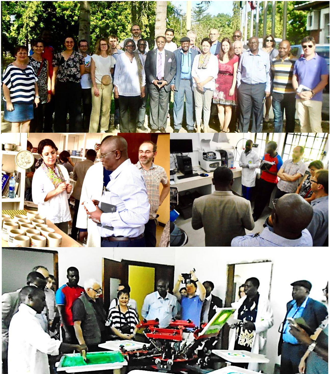
25 participants of the Final meeting of the PanAfGeo Project paid a familiarize visit to the African Minerals & Geosciences Centre (AMGC) in Kunduchi Beach Area, Dar es Salaam, Tanzania.