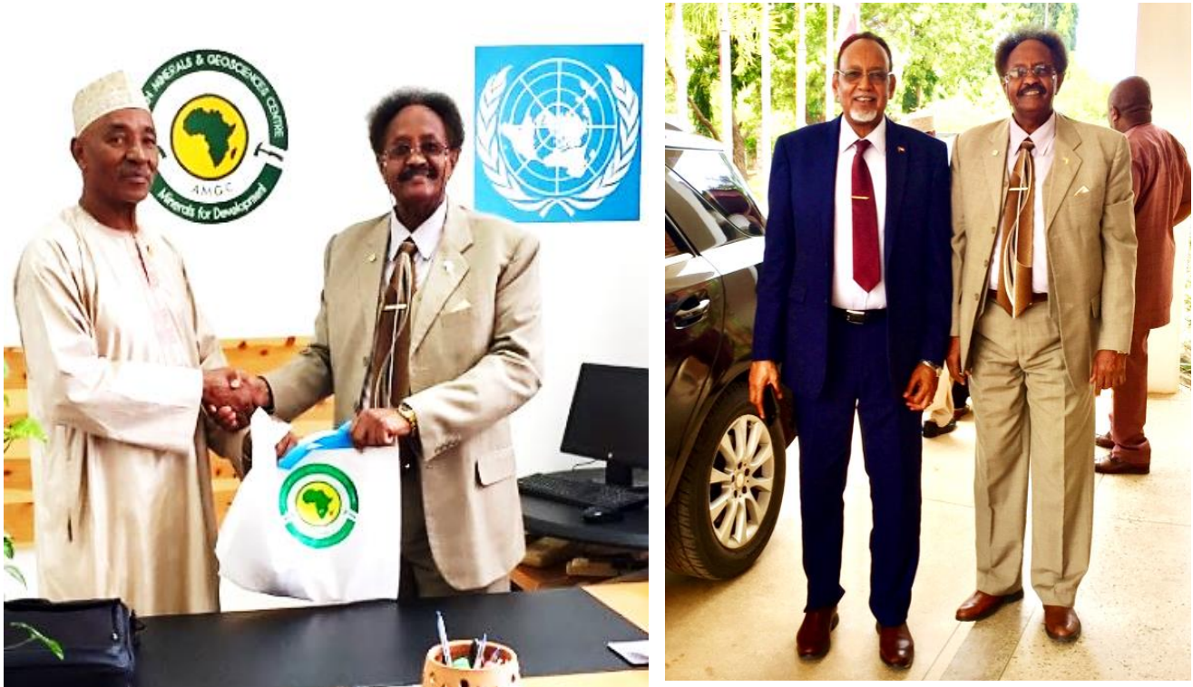
H.E. the Extraordinary Ambassador of Nigeria in Tanzania accompanied by H.E. the Sudanese Ambassador in Tanzania including other six diplomatic dignitaries from the Nigerian Embassy have visited the African Minerals & Geosciences Centre (AMGC)