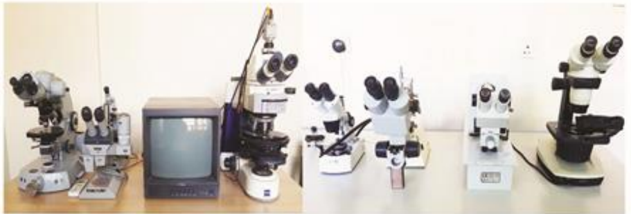
Petrography and Gemmological Microscopes