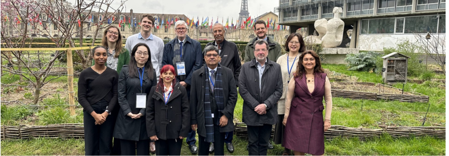
The IGCP Council and UNESCO Secretariat at the 9th Council session