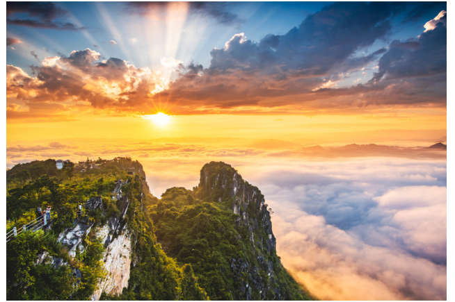
Xingyi UNESCO Global Geopark, P. R. China.