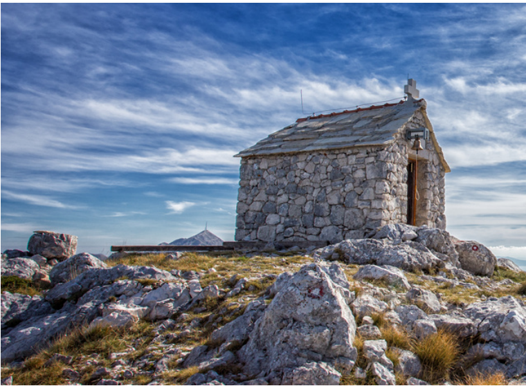
Biokovo-Imotski Lakes UNESCO Global Geopark, Croatia.