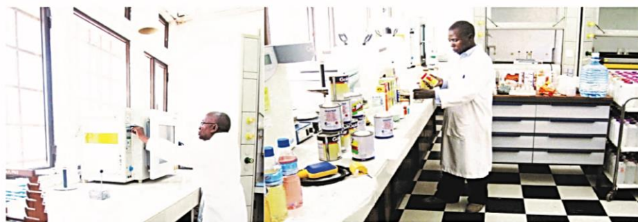
Chemist testing loss on ignition